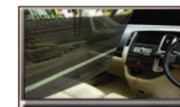
Display Example of Semi-transparent Side View (Left side door/Sidewalk/Pavement side door) is shown as semi-transparent image)

Our latest OVM system goes beyond augmenting the driver's field of view around the vehicle. Combined with image recognition technology, it is able to detect obstacles approaching from any direction and send a warning to the driver.