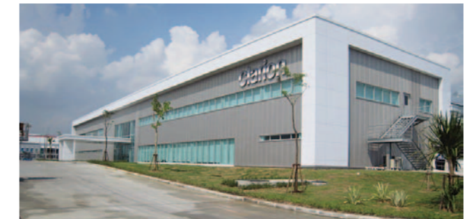
The new Thai Factory started its full operation in April 2012 with production of audio/navigation/camera devices for cars. The planned quantity in the first year of 600,000 units will expand to 2 million units per year in 2016.

As part of the corporate change into an “Automotive Information System Provider,” Clarion has adopted the new brand statement, “moves you • connects you,” and is implementing it globally. This represents the strong desire that “By keeping you connected to sound, information, convenience and safety, Clarion moves you.”