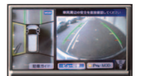
Display Example of OVM (images of OVM and rear view camera)