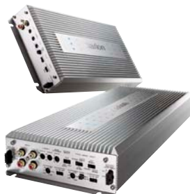
APA4360 180W x 4 Channel Power Amplifier