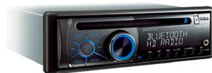
CZ500 Bluetooth® CD/USB/MP3/WMA Receiver