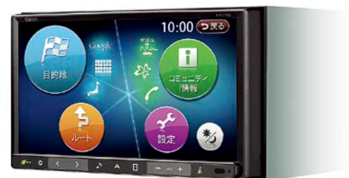
Smoonavi NX710 AV-Navi System with Wide 7-inch VGA Double-DIN Terrestrial Digital TV/DVD/SD