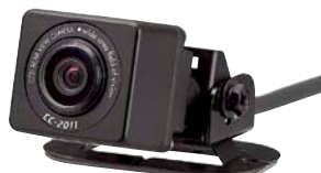
CC2011E Ultra Compact Color CCD Camera (Mirror Image)