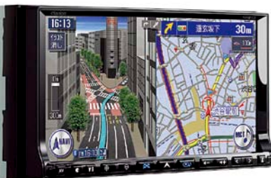
CRASVIA NX810 AV-Navi System with Wide 7-inch VGA Double-DIN Terrestrial Digital TV/DVD/HDD