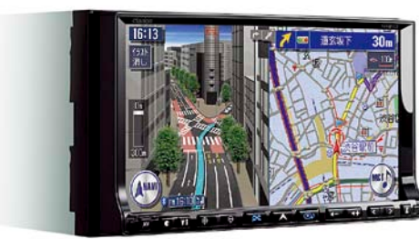
CRASVIA NX810 AV-Navi System with Wide 7-inch VGA Double-DIN Terrestrial Digital TV/DVD/HDD