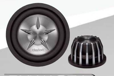
1500W MAX. 12" DUAL 2-OHM VOICE COIL SUBWOOFER